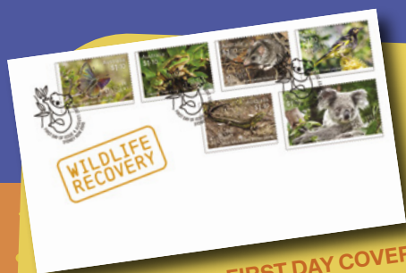
FIRST DAY COVER

SHEETLETS are small sheets, usually with 10 stamps that may be the same or different designs.